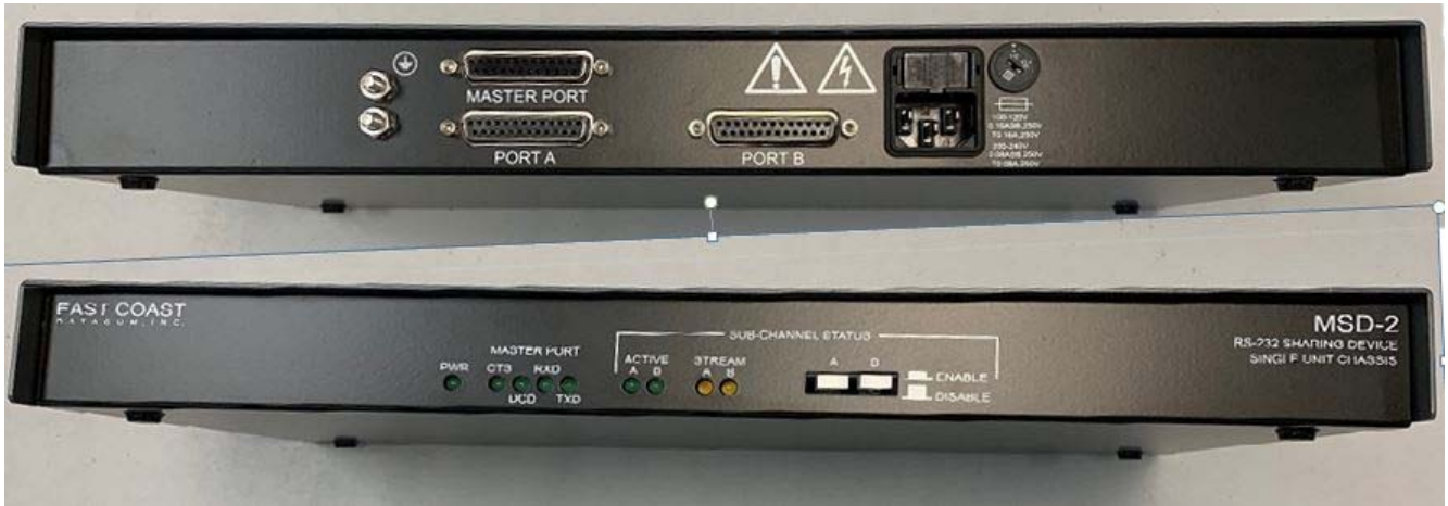
Figure 3 - REAR & FRONT VIEWS, PT# 274000, MSD-2