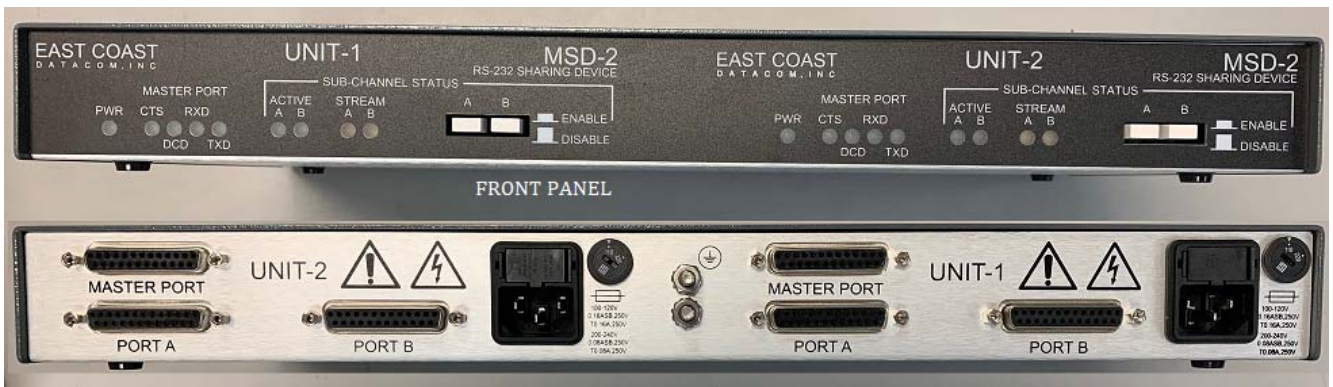
Figure 4 - FRONT & REAR VIEWS, PT# 280000, MSD-2